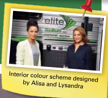
Interior colour scheme designed by Alisa and Lysandra

No expense has been spared in making the Goulburn Off Roader as pleasurable as possible to live in. From the full leather café lounges to the wood accents and marble veneer finishes, the interior reflects the incredible craftsmanship and dedication to build quality that's gone into every component on the van, internally and externally. In the motoring world the only equivalent would be the finest German luxury car makers.