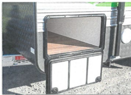
2 X TUNNEL BOOT