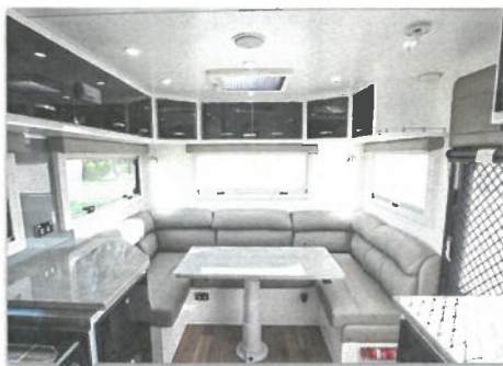
LEATHER CLUB LOUNGE

With a luxury leather club lounge and a generous ensuite you'll feel the freedom of relaxed living. Practical and lavish, the Luxury Class 2200 delivers best of all worlds.