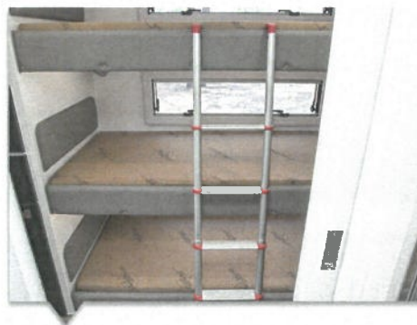
2 - 3 BUNKS (OPTION)