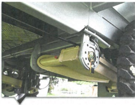
ATX CRUISEMASTER AIR BAG SUSPENSION

The 144L fridge/freezer combo keeps ample amounts of food fresh, whilst the flip-up and slide-out benchtops in the kitchen give you all the space needed for your food preparation.