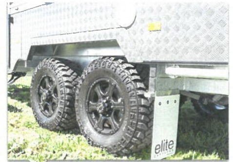
ALL TERRAIN SUSPENSION

FULL OFF-ROAD WARRANTY ANY SURFACE IN AUS - NO EXCLUSIONS