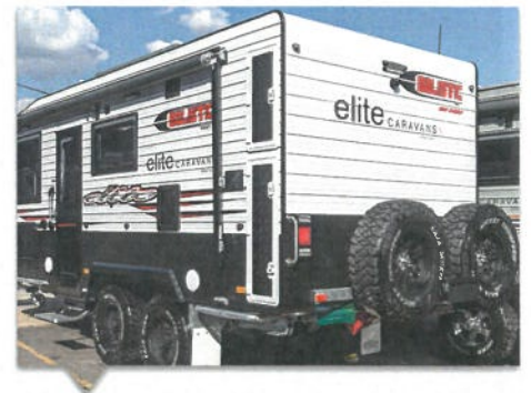
QUALITY OFF-ROAD VAN

FULL OFF-ROAD WARRANTY ANY SURFACE IN AUS - NO EXCLUSIONS