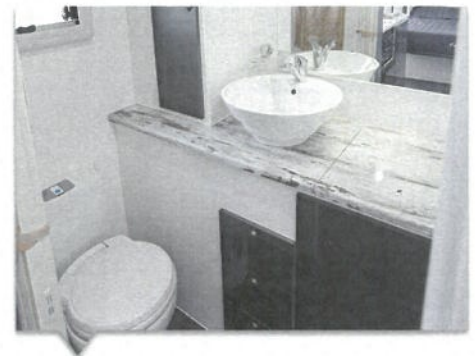
ENSUITE WITH TOP LOADER