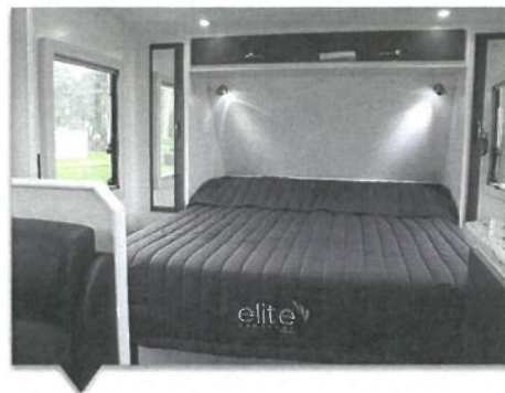
QUEEN SIZED BED